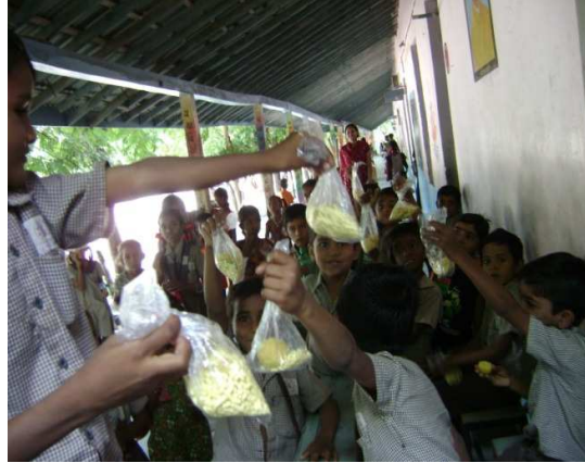
'Tithi Bhojan' served in packets