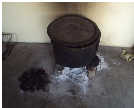
Cooking utensil is not properly maintained