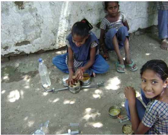
Children are eating the home cooked food during lunch break