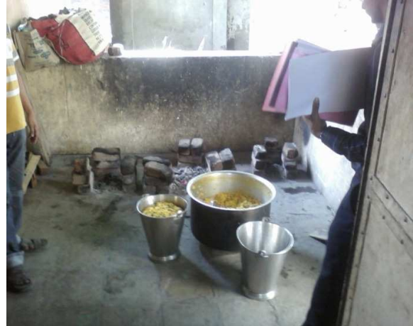
Loliyana Primary School