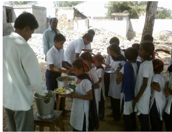
Senior grade children help in serving the food.