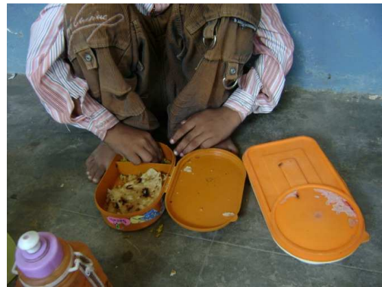
Children enjoying their lunch brought from home