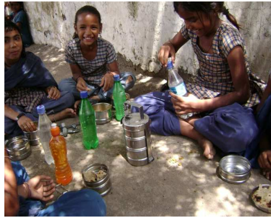
Children are eating home cooked food during lunch break