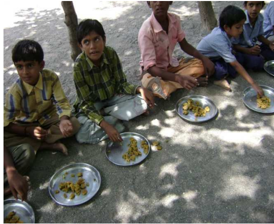
Children are eating on the rough surface