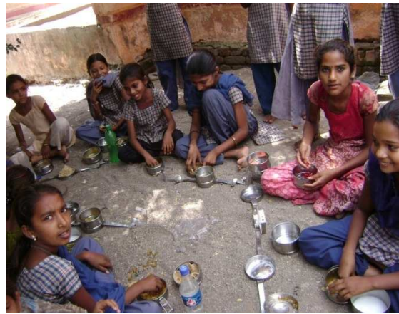
Home cooked food is preferred over MDM