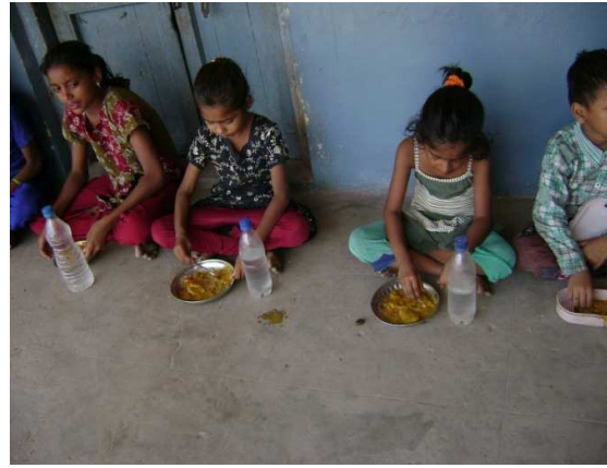
Children eating home cooked food