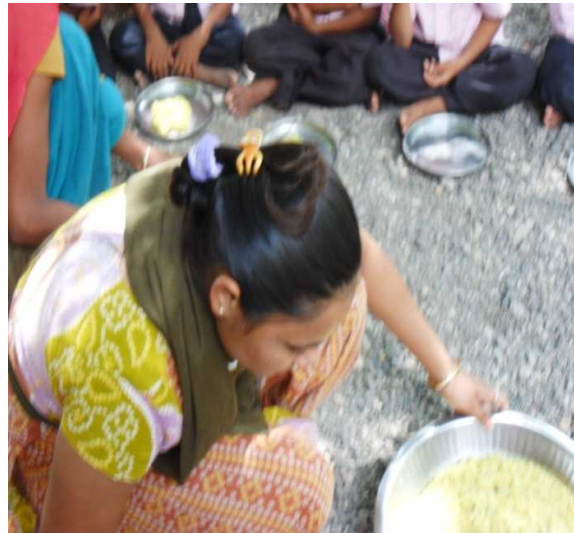
Children are having MDM on rough surface