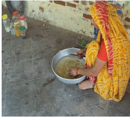
Nagar Prathmik Kanya School